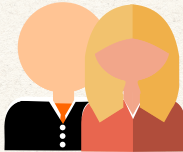
2 - 3 IMPACT Club Leaders

Goal: Female and male adolescents are empowered as active citizens, and equipped to transition well to adulthood.