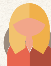
IMPACT Leader (Volunteer)

IMPACT Clubs are facilitated by trained volunteer Leaders from the community that provide members with a safe space to learn and grow. Leaders provide coaching and mentoring, model positive behaviours, and also afford members an opportunity develop a healthy, supportive relationship with trusted adults.