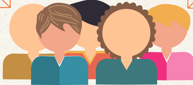
IMPACT Club Members 10-25 members

The IMPACT Club model has four general learning objectives: