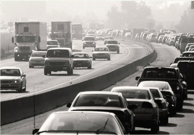
Increased burning of fossil fuels (coal, oil and natural gas)