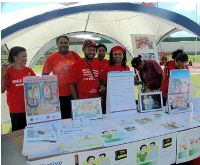
World Vision staff and volunteers participated in a Walk Against HIV and AIDS event in Port Moresby.