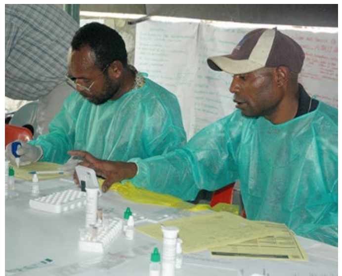
World Vision staff and volunteers learn how to use blood tests to determine HIV status.