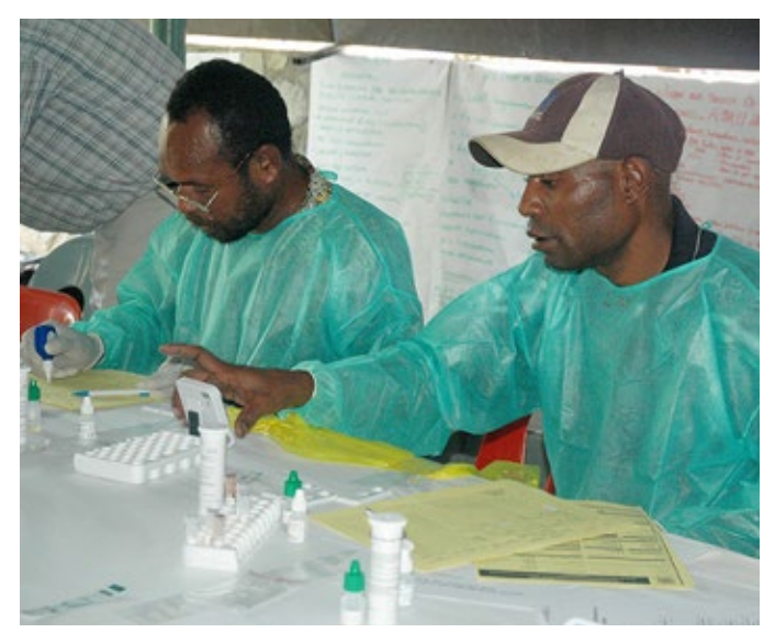
World Vision staff and volunteers learn how to use blood tests to determine HIV status.