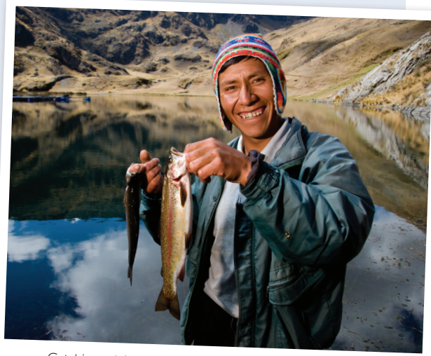
Catching rainbow trout in the Andes Mountains of Peru.

Give a man a fish two times And he'll come back for a third. Teach him how to fish just once And he'll catch the second and third himself.