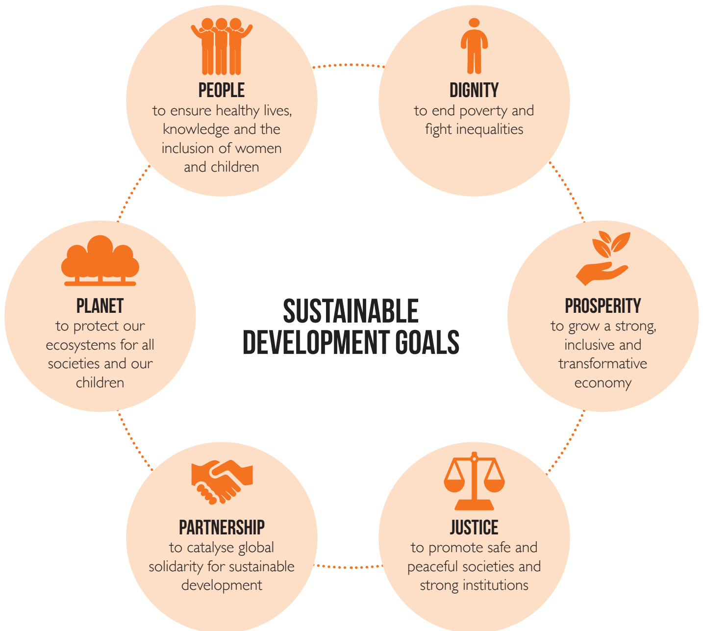
FIGURE 1 SIX ESSENTIAL ELEMENTS FOR DELIVERING THE SUSTAINABLE DEVELOPMENT GOALS