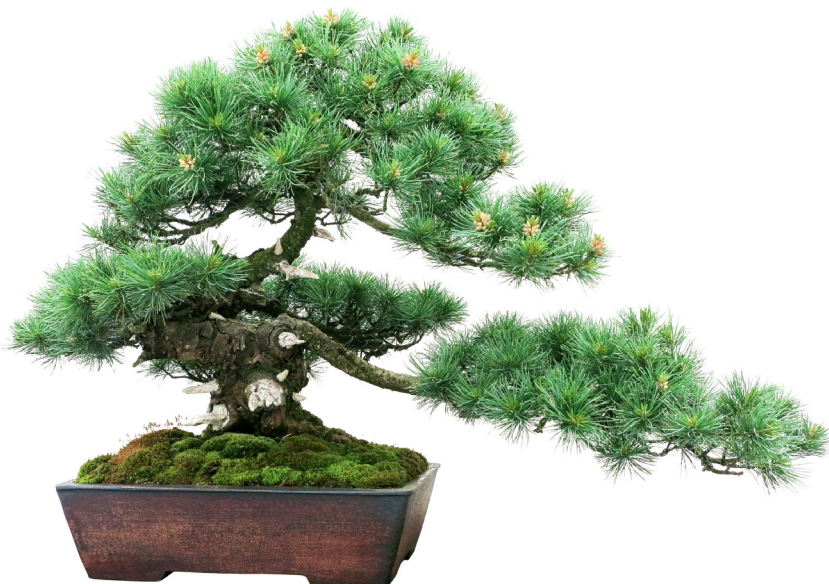
Image: 2015 - Exposition Internationale de Bonsaï

Source: www.nobelprize.org/nobel_prizes/peace/laureates/2006/yunus-lecture-en.html