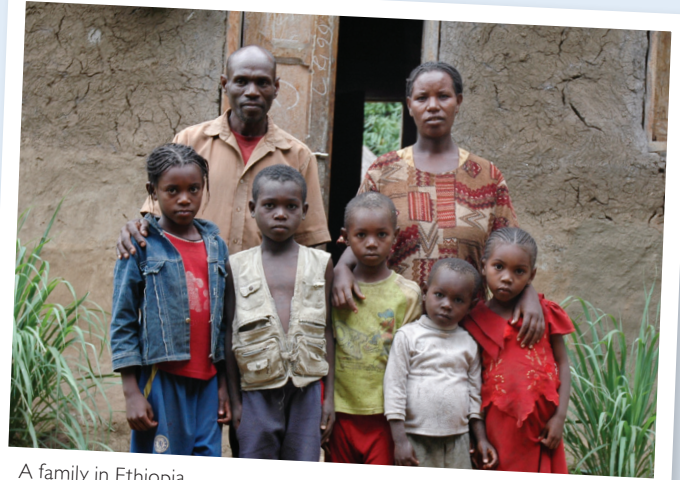
A family in Ethiopia.