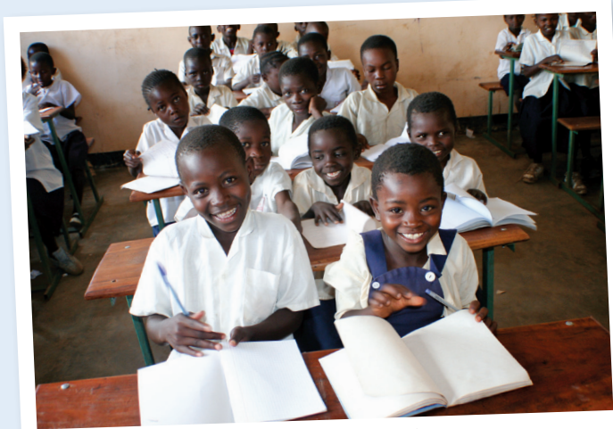
School children in the Democratic Republic of Congo.