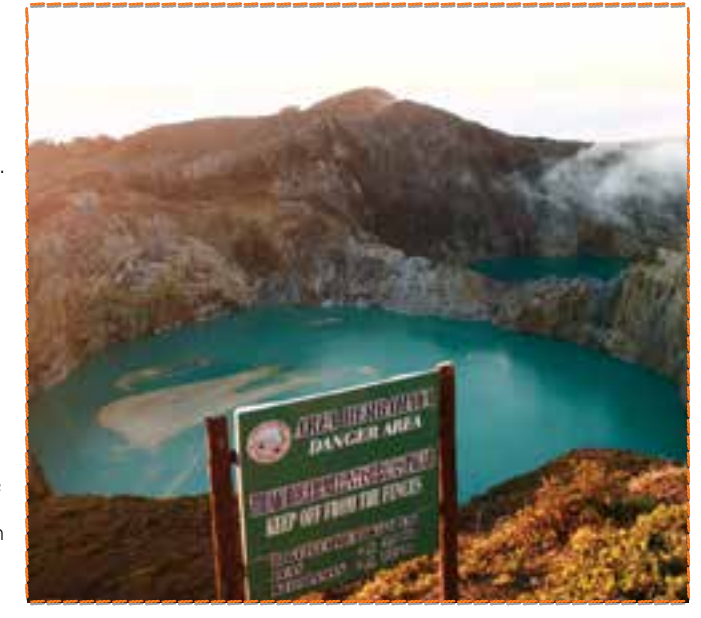
Kelimutu is a volcano of three crater lakes 1,639m above sea level. The scenic lakes are a popular tourist destination on the island of Flores and the area became Kelimutu National Park in 1992.

About 60 percent of Indonesia's 248 million people live on Java – the island with the capital city, Jakarta. Most Indonesians have a Malay heritage but there are many ethnic groups and over 300 languages, with Indonesian _____. More than 80 percent of the people being the national _____ are Muslims, about 10 percent are Christians, and there are minorities of Hindus, Buddhists and animists,