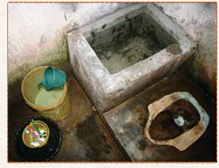
Bathroom and toilet in rural Indonesia. Improving access to sanitation is an important aspect of aid and development work.

3. Multilateral aid is assistance provided by governments to international organisations like the World Bank, the United Nations and the International Monetary Fund that is then used to reduce poverty in developing nations.