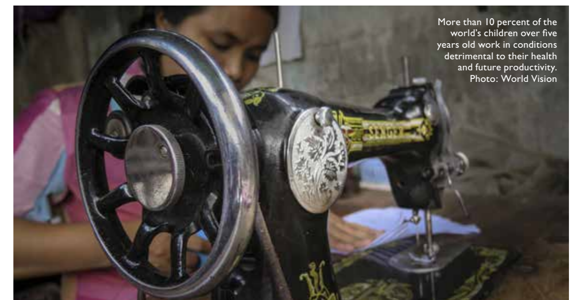
More than 10 percent of the world's children over five years old work in conditions detrimental to their health and future productivity.