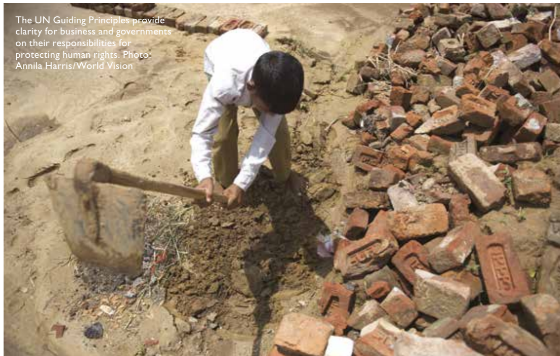
The UN Guiding Principles provide clarity for business and governments on their responsibilities for protecting human rights.

States, on the other hand, are required “to take all reasonable measures to investigate, prevent, punish and redress business-related human rights violations through adjudication, legislation, policies, and regulations”. 62