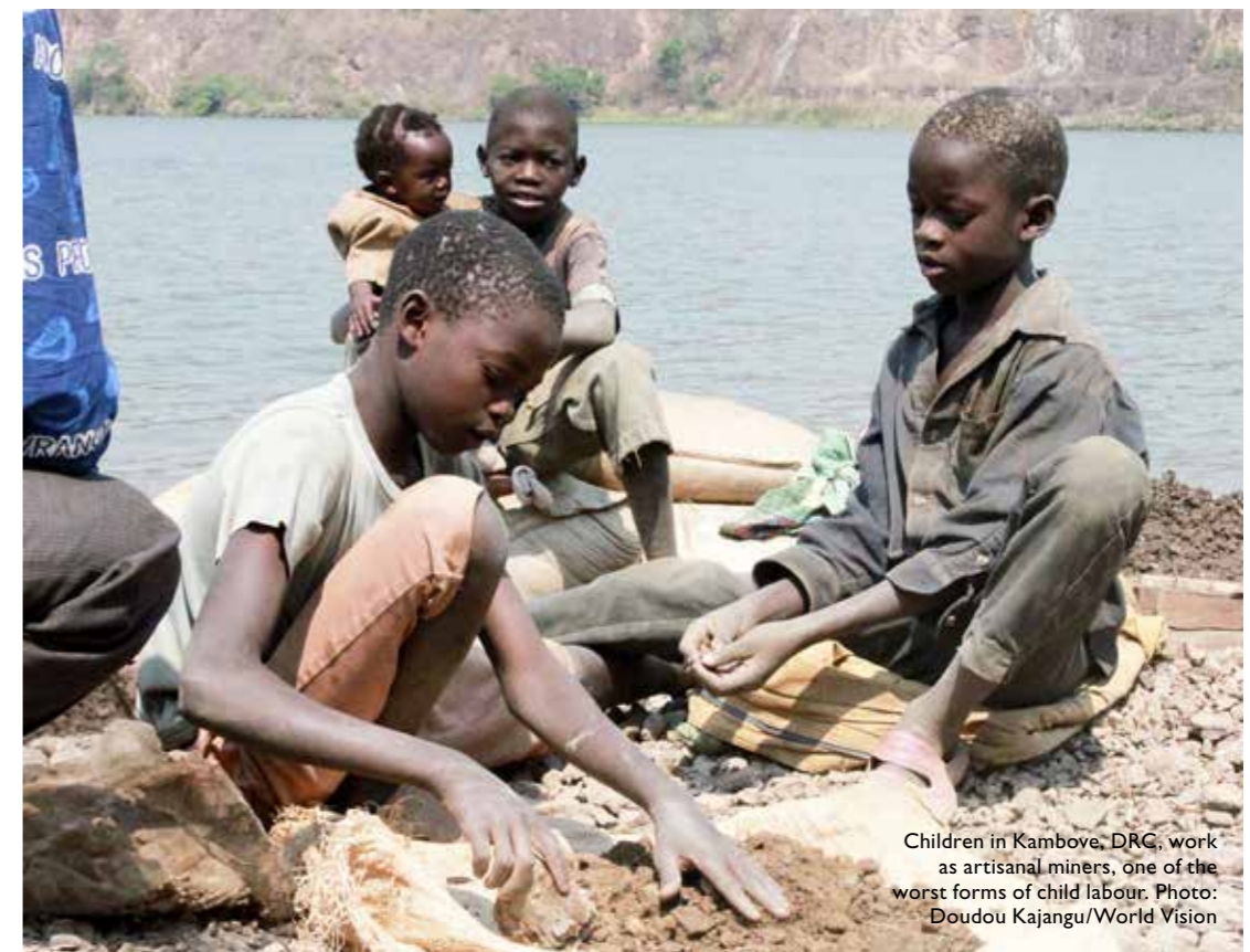
Children in Kambove, DRC, work as artisanal miners, one of the worst forms of child labour.