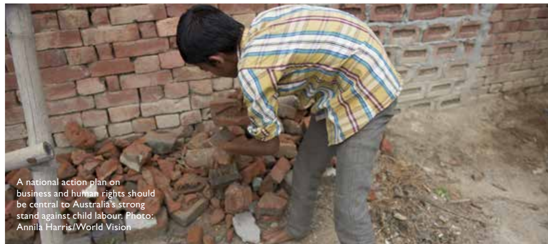
A national action plan on business and human rights should be central to Australia's strong stand against child labour.

To date, Denmark, Finland, Italy, Lithuania, the Netherlands, Spain and the United Kingdom have all published national action plans for the implementation of the UNGPs. More than 20 other countries, including the United States, Norway, France, Germany and Jordan, have national action plans in progress.