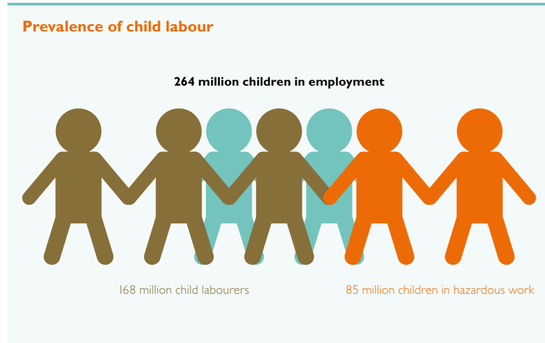
Figure 1: Hazardous work is a subcategory of child labour, which in turn is a subcategory of children in employment

As of 2012, the ILO estimates that more than 264 million children are in employment around the world. Of that figure, nearly 168 million work in conditions classified as child labour. These 168 million children represent more than 10 percent of the world's children aged five and above. 8