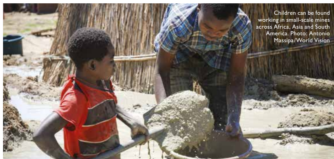
Children can be found working in small-scale mines across Africa, Asia and South America.