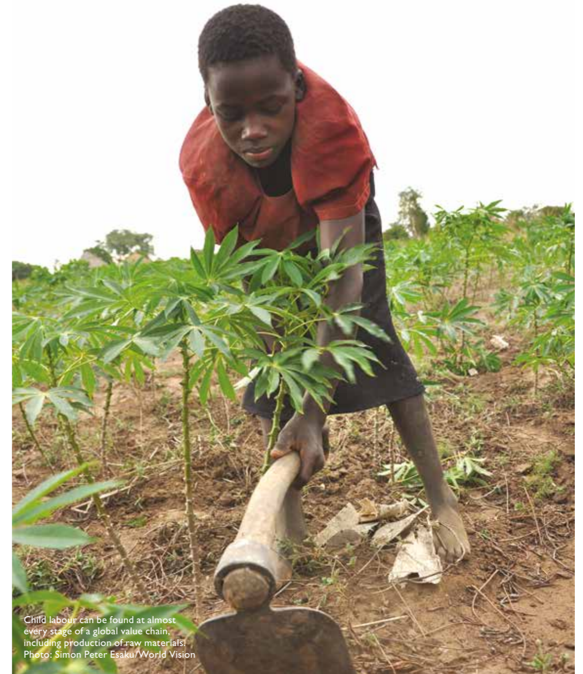
Child labour can be found at almost every stage of a global value chain, including production of raw materials.