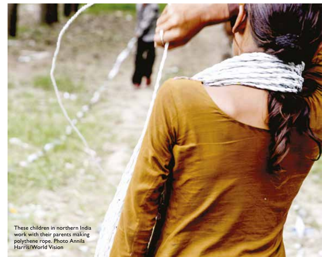
These children in northern India work with their parents making polythene rope.