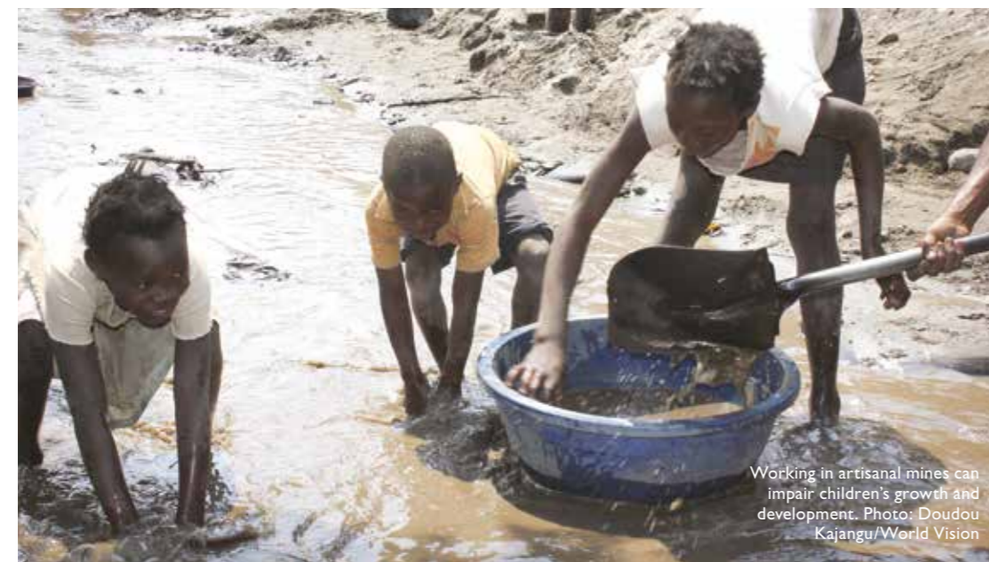
Working in artisanal mines can impair children's growth and development.

This figure alone should be enough to mobilise the necessary global support and leadership to accelerate action on reducing the market for goods produced through child labour as well as addressing the root causes. Yet the high proportion of child labourers in the lower age groups is not only of moral significance, it is also highly relevant to the issue of a country’s job market, its stock of human capital and potential for growth.