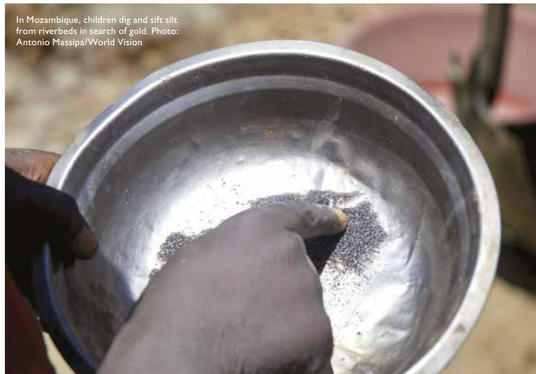
In Mozambique, children dig and sift silt from riverbeds in search of gold.

Basu and Van 34 articulate an economic model that suggests participation in child labour has a depressive effect on adult wages, which then results in households relying on child labour to supplement household income.