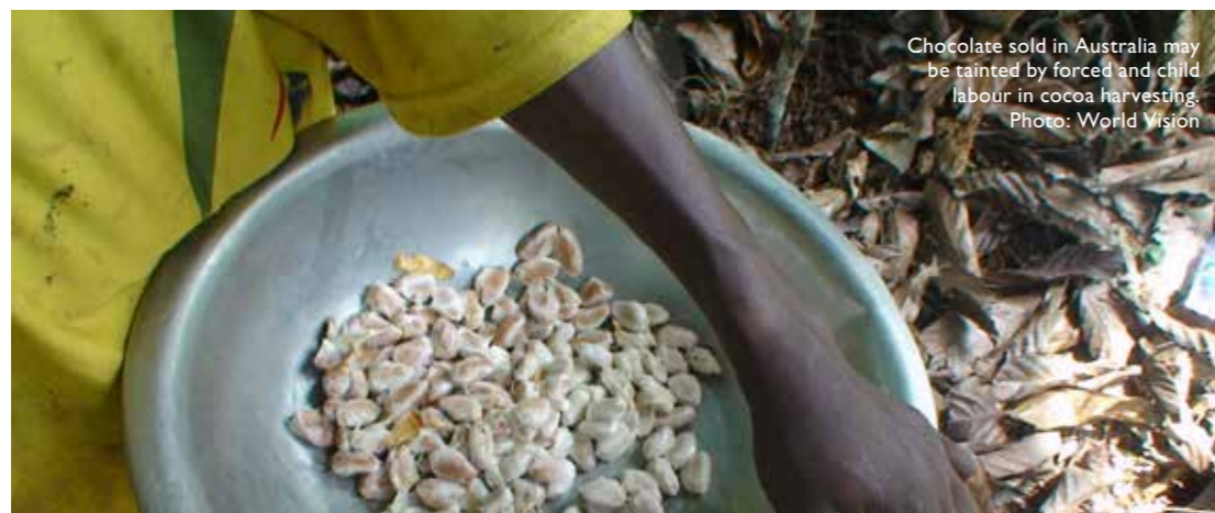
Chocolate sold in Australia may be tainted by forced and child labour in cocoa harvesting.