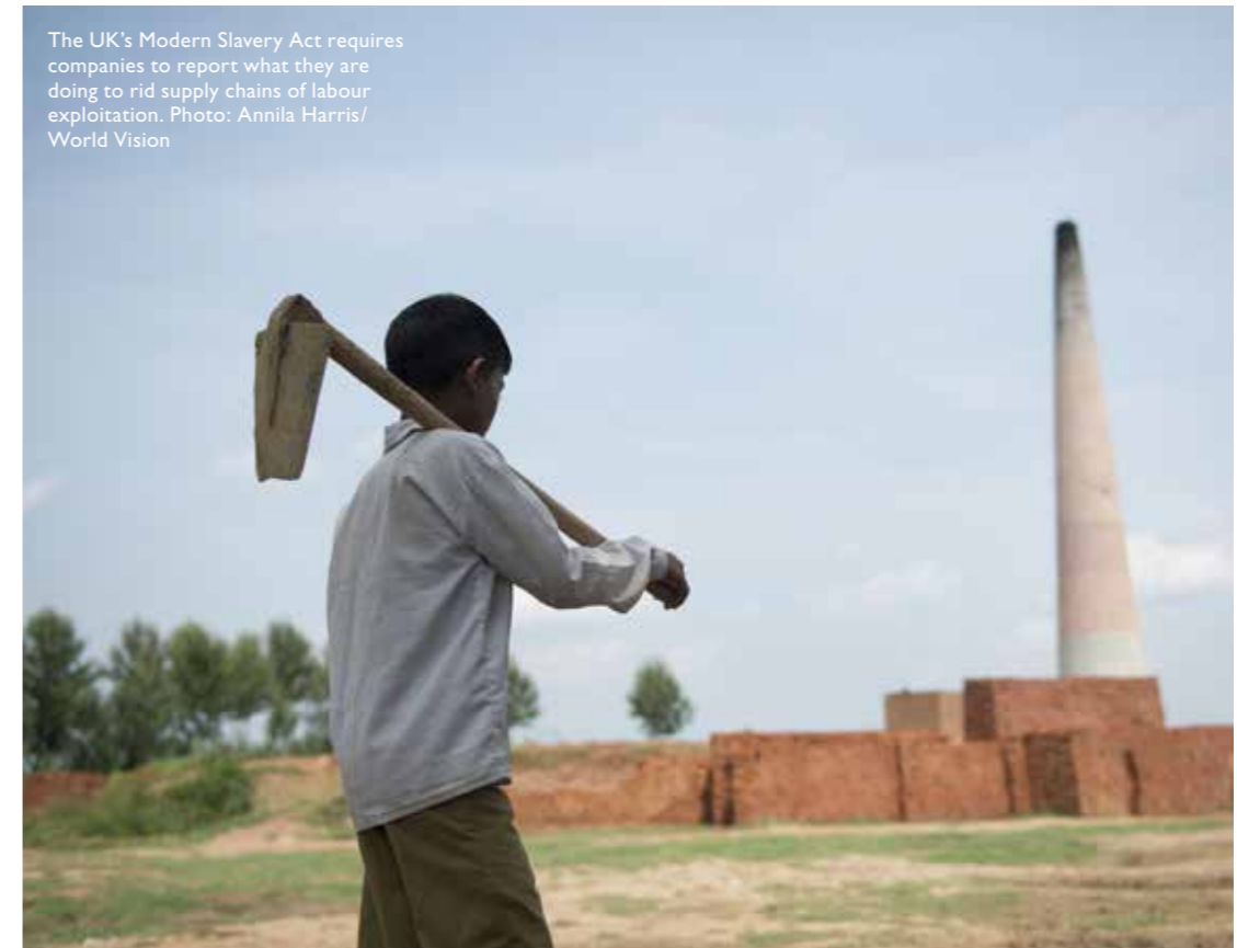
The UK's Modern Slavery Act requires companies to report what they are doing to rid supply chains of labour exploitation.

In March 2015, the United Kingdom passed the Modern Slavery Act 2015, which, in addition to enhancing support and protection for trafficking survivors, includes a transparency in supply chain clause. Among other things, this clause requires large companies conducting business in Britain to produce mandatory statements reporting on the steps they are taking to ensure their supply chains are free from labour exploitation.