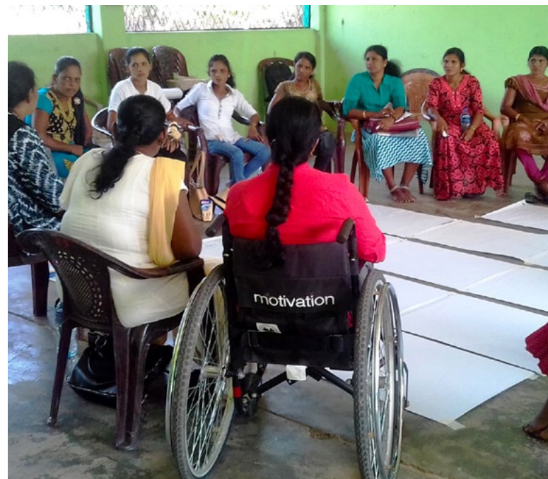
A Social Inclusion session being conducted with women with disabilities at Vaharai (East Sri Lanka)