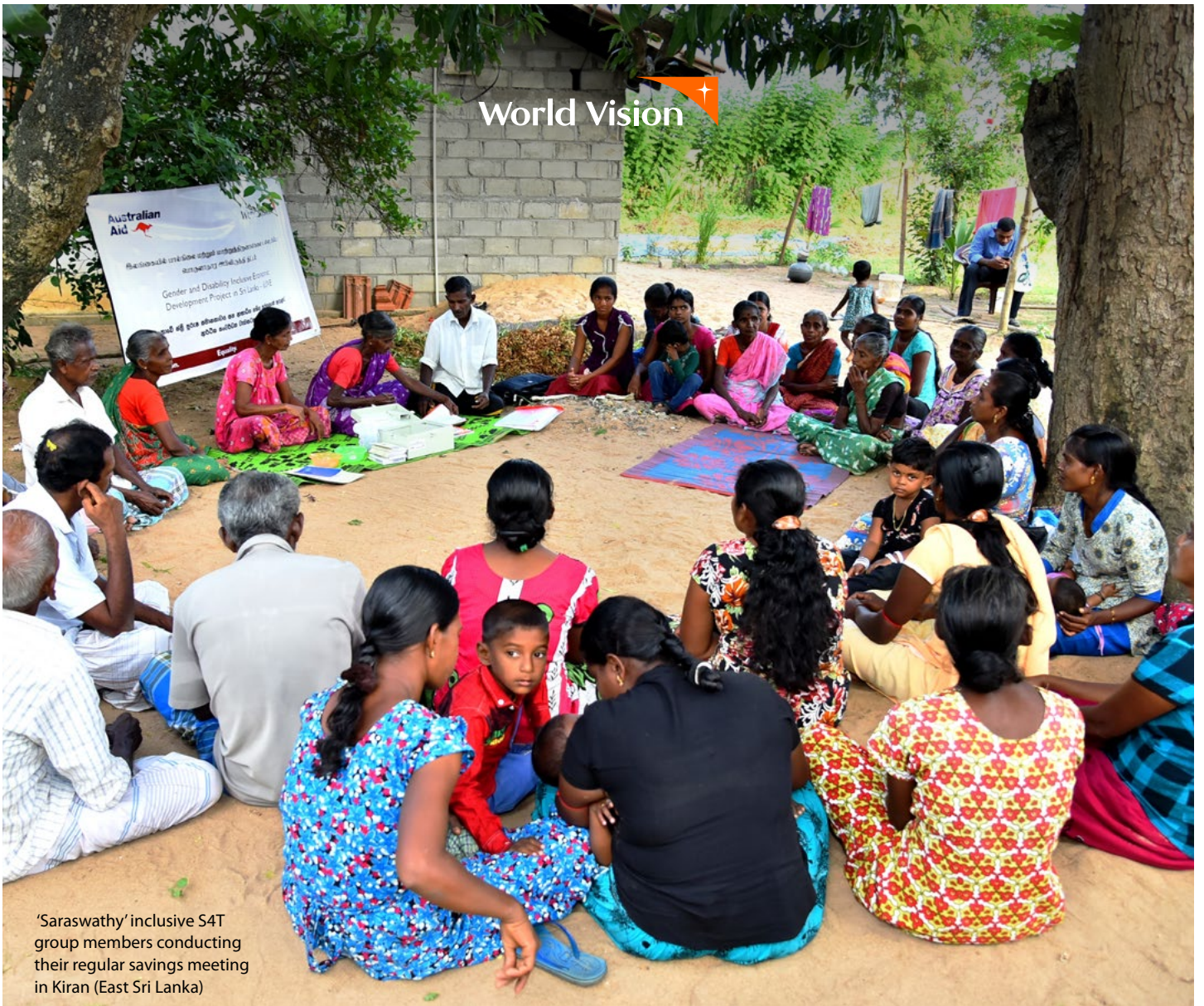
'Saraswathy' inclusive S4T group members conducting their regular savings meeting in Kiran (East Sri Lanka)