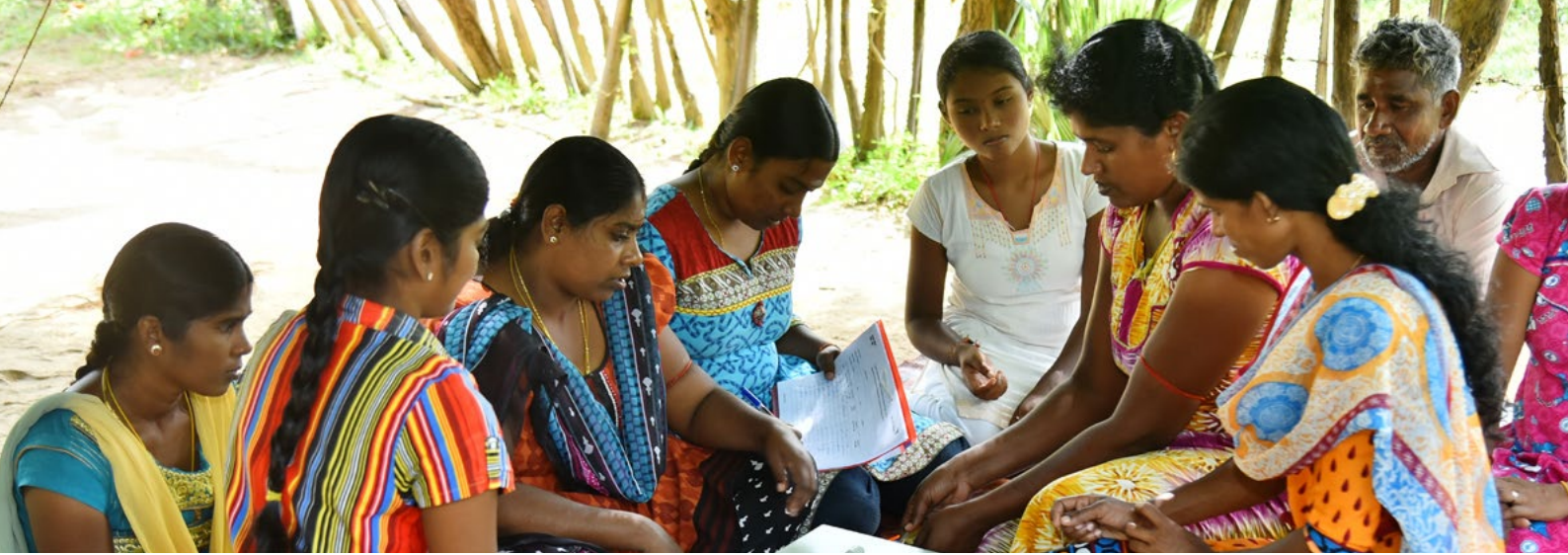
'Virudsam' (name of the S4T group) is an inclusive Savings for Transformation (S4T) group that engages in regular savings meetings in their village located in Muthur (East Sri Lanka)