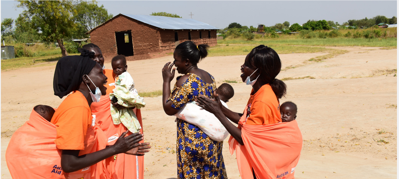
Mothers groups established through GREAN equipped women with health, hygiene and nutrition skills to reduce the spread of illness and improve their children's health and development.