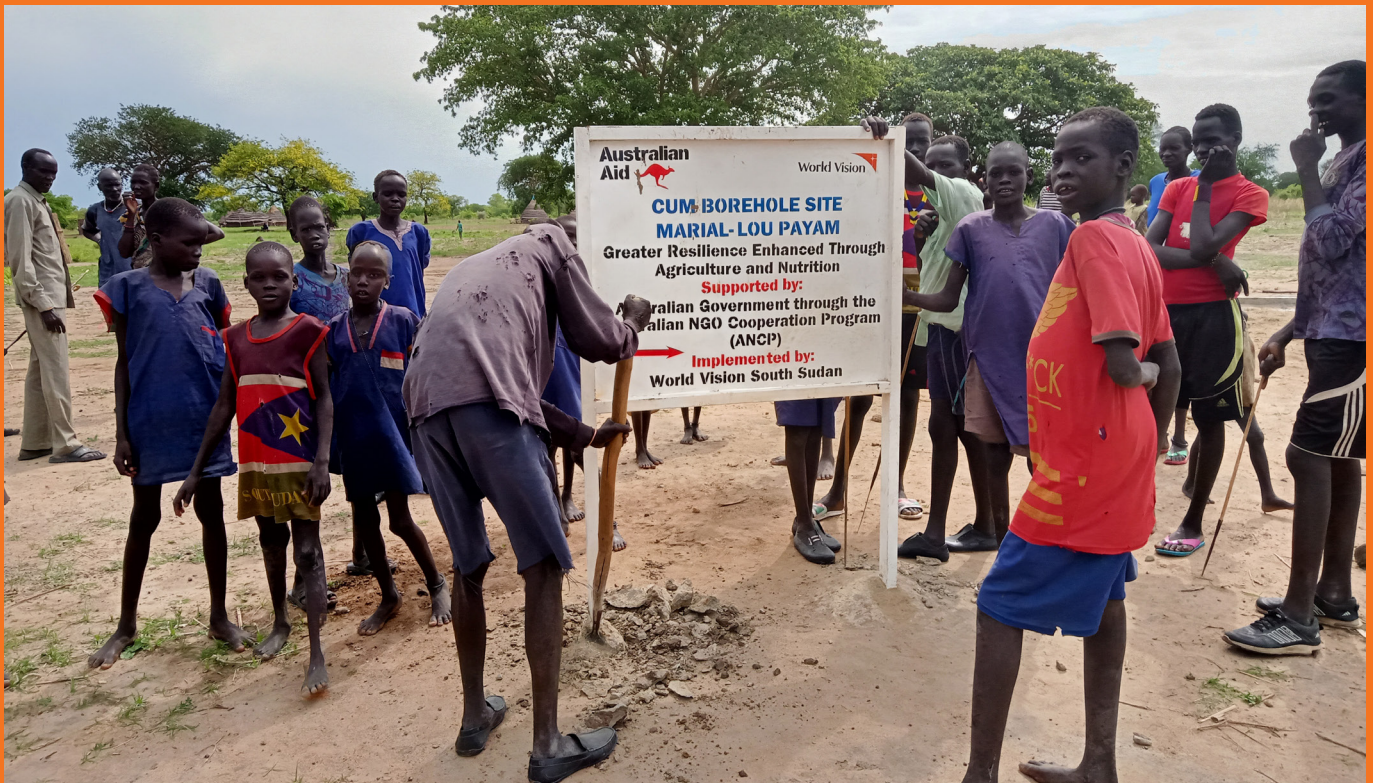
Community members gather around signage for the new borehole in their village. Provided through the GREAN project, the water point saves many hours walking long distances to fetch water.