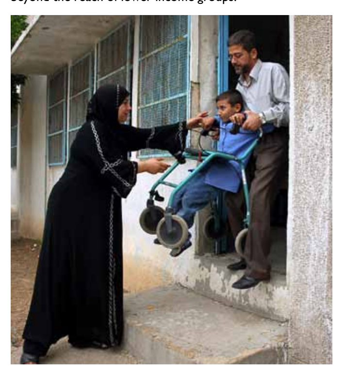
World Vision works with Palestinian refugees in Lebanon, providing educational opportunities for children with disabilities by empowering local organisations to implement quality programs.

The return of many of Lebanon's own refugees has pushed up prices for services and housing, taking these things beyond the reach of lower income groups.