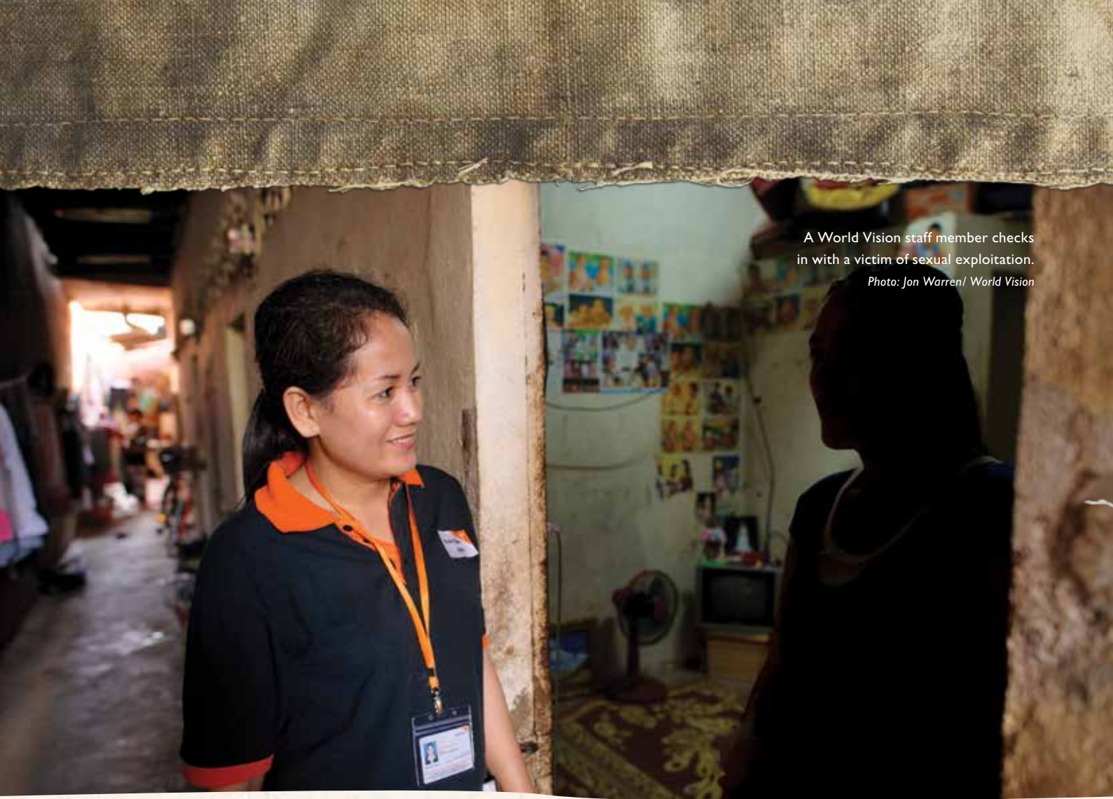
A World Vision staff member checks in with a victim of sexual exploitation.