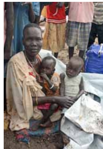
A mother nursing her children in Malakal, Upper Nile.

Humanitarian organisations are in a race against time to pre-position food, essential items and agricultural supplies before the start of the rainy season in June. Once there is heavy rainfall, much of the country's limited road infrastructure will become inaccessible, making humanitarian organisations like World Vision almost solely reliant on costly air operations to bring aid to conflict-affected areas. The hostilities have severely impeded efforts to pre-position supplies, particularly along key transport routes, which means that humanitarian organisations have been largely dependent on transporting supplies via air already,