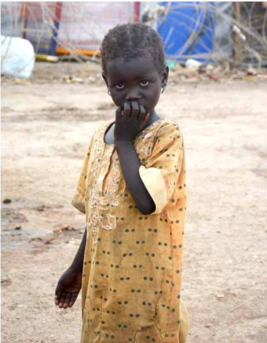
Young girl at a Protection of Civilians site in the state of Upper Nile.

Often these children have had to make frantic journeys to seek refuge, moving multiple times to flee violence. Even when they do find relative safety in a PoC site, they continue to live in fear of further attacks. The widely publicised attack on civilians at the PoC site in Bor on April 15, 2014 has caused many children to believe they are not safe even on UNMISS bases. They also fear violence and abuse from those living around them. Tensions are mounting in overcrowded