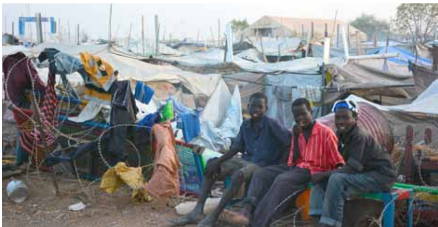
Boys gathered in a Protection of Civilians site in Upper Nile.