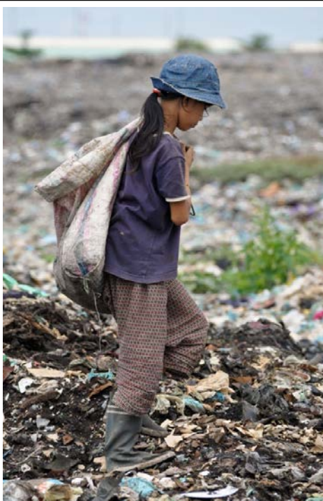
A child labourer works in filthy conditions on a rubbish dump in Cambodia.

Many parents may have been child labourers or kept out of school themselves. With little education about alternative solutions or the risks that face their children, they may not see another choice.