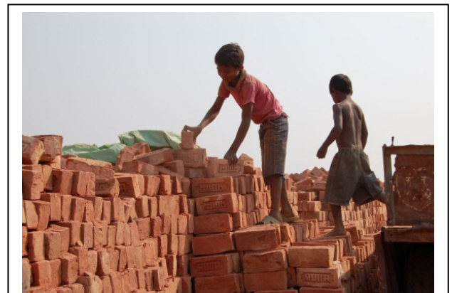
Two young boys work in dangerous conditions in a brick factory in Nepal.

Governments, business and civil society must work together to address the root causes of child labour, to ensure that families can earn a decent wage so they can support their children's education and that there are safe alternative solutions in place to help children transition from labour to education.