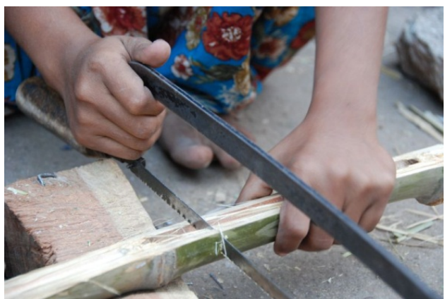
Instead of being in school, a child labourer works every day using sharp tools to cut bamboo for weaving.

Individuals must ask questions of the companies they buy from, to ensure they are not indirectly supporting the use of child labour in the products they buy. They must put pressure on companies to provide transparent information about how their products are made and their company’s practices. Just as governments can encourage better practice through public procurement policies, by demanding more ethical products, the public can send a message to corporations that they will not tolerate children being exploited for profit.