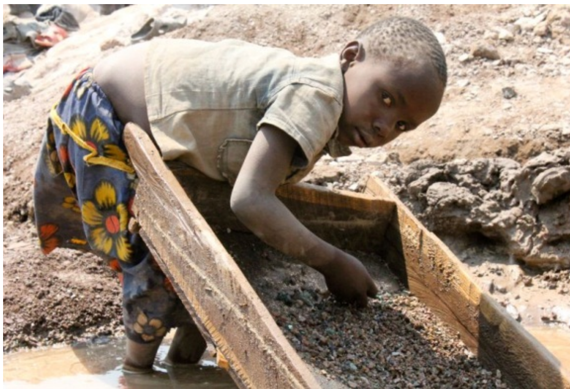
This child from the Democratic Republic of Congo works with her mother and siblings in a copper mine all day instead of going to school.

Child labour is work that deprives children of their childhood, their potential and their dignity. It is work that is mentally or physically dangerous and harmful to children, and that interferes with schooling.