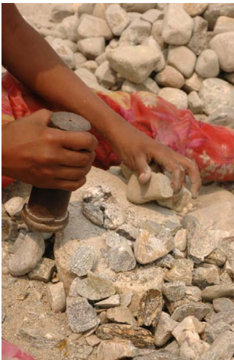
A young girl in India breaks stones all day that will be sold for use in the construction industry.

For example, child labourers in cotton fields breathe toxic pesticides that are sprayed on the crops. This can cause tremors and in some cases paralysis, as the pesticides are designed to impede the nervous systems of pests. When suffering these conditions, children will have more limited employment opportunities in the future, and often increased medical costs, making it more difficult for them to escape poverty.