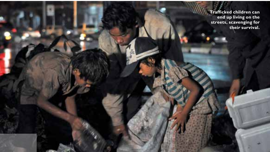
Trafficked children can end up living on the streets, scavenging for their survival.

The essence of the human rights due diligence approach – commit, assess, implement and report – is similar to other core business activities, for example in relation to consumer protection or environmental laws.