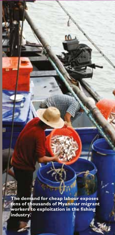
The demand for cheap labour exposes tens of thousands of Myanmar migrant workers to exploitation in the fishing industry.