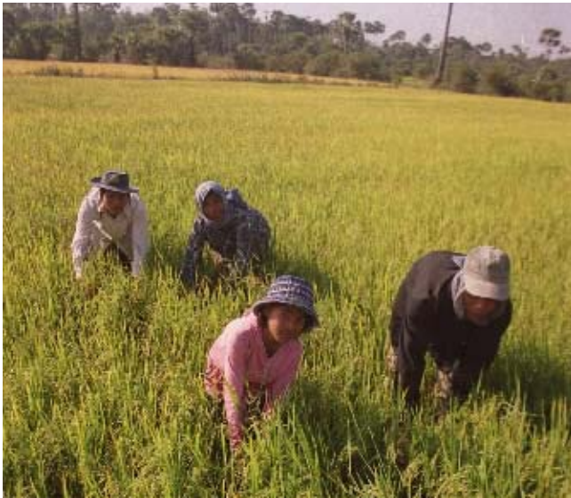
Community members learn to live in areas affected by landmines. Through World Vision training and support for an animal husbandry and agriculture project, parents are now able to feed their children and send them to school.

The Banan Area Development Project, ADP is west of Phnom Penh in an area previously referred to as the 'rice bowl' of Cambodia because of its fertile soil and intensive rice cultivation. Many people fled as their homes were destroyed by ongoing war. World Vision began working with returnees in 1994 focusing on health, agriculture, skills training for the disabled (landmine victims), landmine awareness education, and de-mining, in partnership with the Mines Advisory Group (MAG). Sponsorship was introduced in 1996.