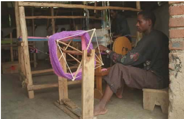
Community members learn income-producing activities like, weaving.

Farmers are assisted to increase the amount and variety of food they produce through the provision of resources and training. Goats, sheep and poultry have been purchased to improve community members' diet and a veterinary post has been established. To diversify their produce, farmers are planting new crops such as apple and avocado. Irrigation schemes are helping to improve crop production and farmers are employing appropriate techniques to prevent further environmental damage. The community is learning other income-producing activities including bee keeping, pottery, soap making and weaving and loans are made available to assist people to run small businesses.