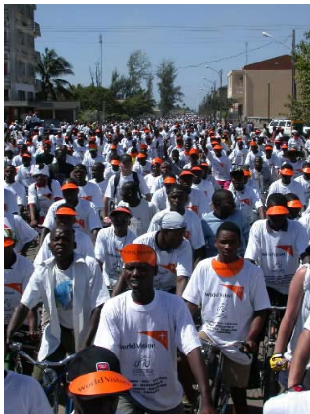
Approximately 800 cyclists and thousands of spectators witnessed the opening ride of World Vision's month-long AIDS Cycle Relay an international cycle event which visited six countries in Southern Africa to raise awareness of the AIDS pandemic.

People with finance, knowledge and technology can provide advice and help but they should not control the process. People being offered assistance play a vital part in defining what can be done and implementing changes. People who are given 'handouts' can feel inadequate, powerless and dependent.